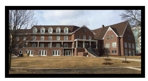
Alpha Gamma Rho Eta Chapter, Iowa State University 201 Gray Avenue Ames, Iowa 50014

Please update your email with Eta Chapter AGR! If you haven't been receiving emails from us containing important event information and chapter updates, please send us your email address to jermier9@iastate.edu